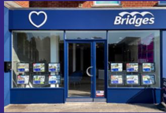
FARNHAM ☎ Sales 01252 723723 ☎ Lettings 01252 361555 ✉ farnham@bridges.co.uk