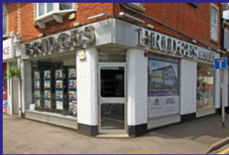
FRIMLEY ☎ Sales 01276 65100 ☎ Lettings 01276 588100 ✉ frimley@bridges.co.uk