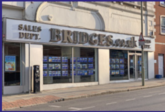
ALDERSHOT (Sales) ☎ Sales 01252 361501 ✉ aldershot@bridges.co.uk