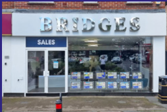
FARNBOROUGH (Sales) ☎ Sales 01252 370001 ✉ farnborough@bridges.co.uk