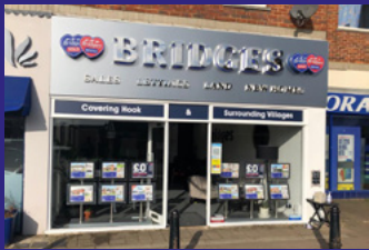
HOOK ☎ Sales 01256 769999 ☎ Lettings 01256 769998 ✉ hook@bridges.co.uk