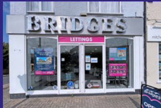
FARNBOROUGH (Lettings) ☎ Lettings 01252 359887 ✉ lettings@bridges.co.uk